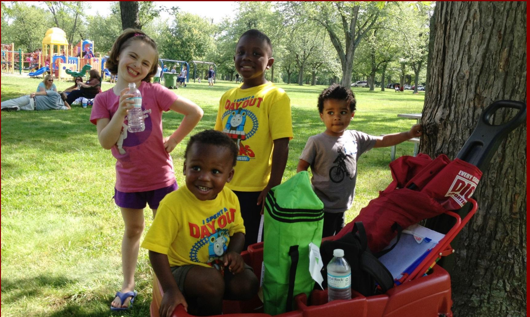
2013 Adoption Star Picnic