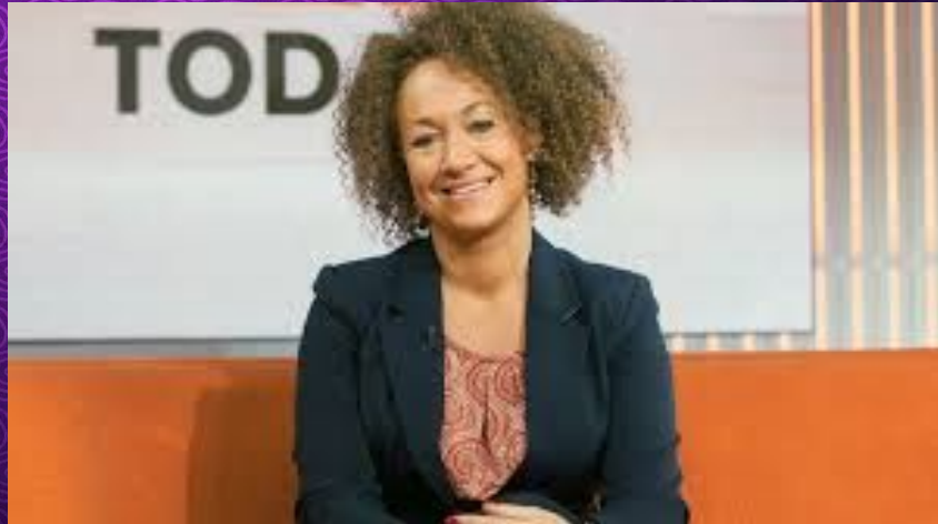
Image from the Today Show.

Transracial does not mean identifying with another race that you are not, like the Rachel Dolezal incident.